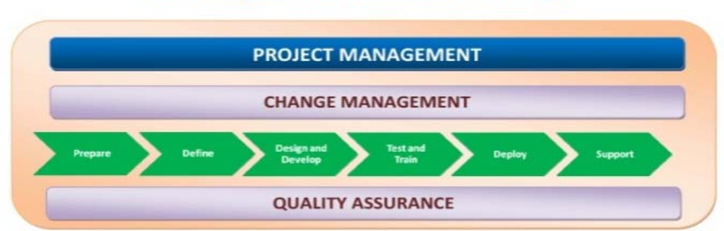
ERPA Implementation Methodology

01 – Prepare: This phase begins with planning for all the activities related to the Project. ERPA Project Manager will work with the City Project Manager and Project Steering Committee to develop the final baseline project plan, Project schedule, Change Management Plan, Communication Plan and the Project Staffing plan. The phase ends with determination of the architecture and infrastructure needed to support the environments and the setup of the preliminary environments needed for the initial design activities.