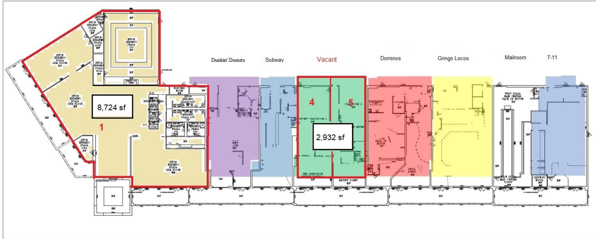
Retail 1 - Space 1 (8,724 SF) and Spaces 4 & 5 (combined 2,932 SF)